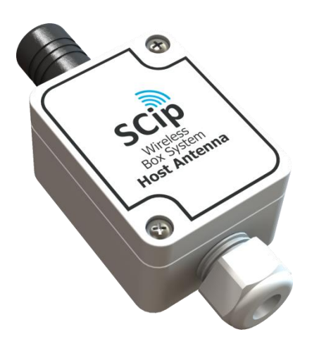
For use with: